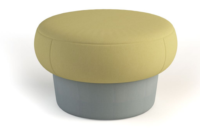
MUFFET WITH TWO FABRIC OPTION

The Muffet is ideal for children's areas and seating. Muffet is available in full round only.