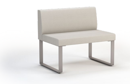
NEWPORT STRAIGHT 36" UNIT