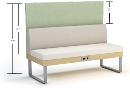
NEWPORT BANQUETTE SHOWN WITH OPTIONAL PRIVACY PANEL AND POWER/DATA