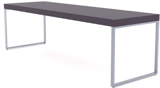
PARMA STRAIGHT METAL LEG

Add upcharge to list price and code to model number