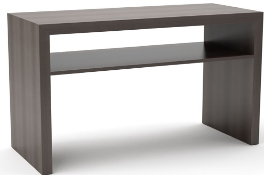
PARMA BAR HEIGHT PANEL TABLE WITH OPTIONAL SHELVING NOTE: LAMINATE SHELF IS PLACED 10" BELOW TABLE TOP UNDERSIDE

POWER + WIRE MGMT NOTE: LAMINATE PANEL LEG - WHEN TWO OR MORE LAMINATE PANEL TABLES WILL BE JOINED, AH MUST BE ORDERED TO DAISY CHAIN POWER/DATA UNITS PLEASE SEE POWER + WIRE MGMT LINK UNDER PRODUCT WEBPAGE IMAGES.