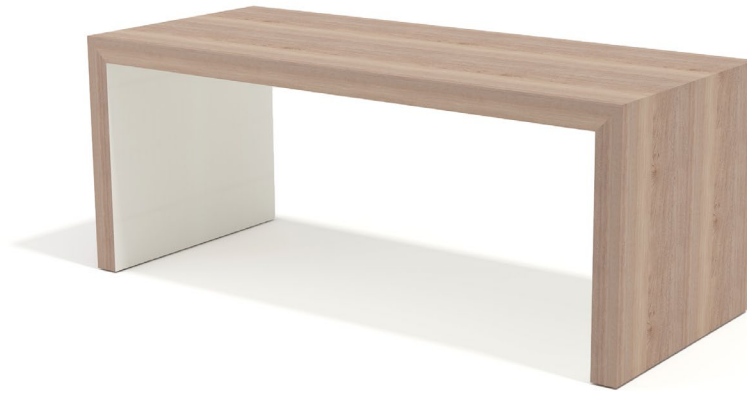
PARMA PANEL TABLE WITH OPTIONAL TWO LAMINATES