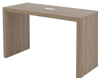
LAMINATE PANEL BAR HEIGHT WITH COVE POWER/DATA