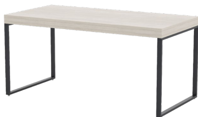
STRAIGHT METAL LEG

Parma Tables offer two looks showcasing its substantial three inch top and have an array of useful applications for training, dining or multi-use areas. The metal legs come in straight. The full laminate panel looks great ganged together to create the ultimate surface for learning or collaborating and makes a great touchdown spot for a meeting.