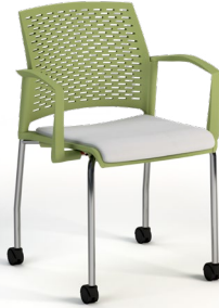
4 LEG CHAIR / ARMS / CASTERS

The Rewind chair features a two piece polypropylene shell with a slotted back and a clean out feature. The slotted back design offers style and ventilation. Frames are available in standard polished chrome or optional powder coat color finishes.