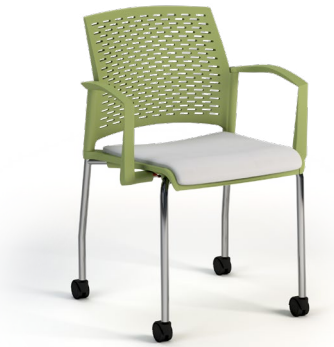
4 LEGGED WITH ARMS AND CASTERS SHOWN WITH SEAT INSERT