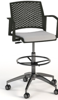
5 STAR SWIVEL ARM CHAIR WITH CASTERS AND HIGH CHAIR KIT