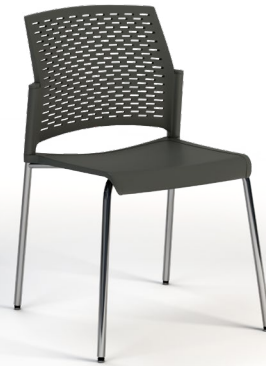
4 LEGGED CHAIR