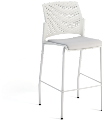
BAR STOOL SHOWN WITH SEAT INSERT