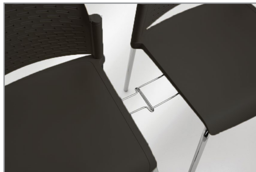
EASY FOLDOUT GANGING (FACTORY INSTALLED ONLY)