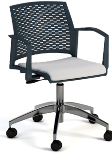
5 STAR SWIVEL ARM CHAIR WITH STANDARD POLISH CHROME SWIVEL BASE WITH BLACK CASTERS AND WITH SEAT INSERT