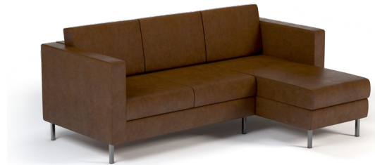
THREE SEAT SAMMY LOUNGE WITH CHAISE