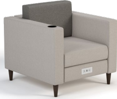
SAMMY ARM CHAIR WITH OPTIONAL WOOD LEGS AND POWER / DATA

The Sammy is fully upholstered over high resiliency foam on a solid hardwood frame featuring square steel tube legs. Designed for student housing and any public spaces that require long duration seating comfort and greater width and depth.