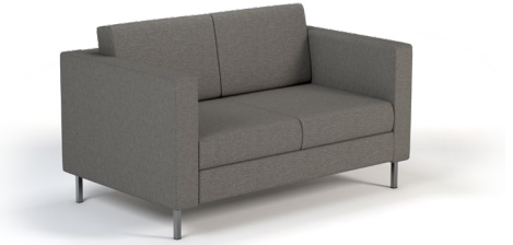
TWO SEAT SAMMY LOUNGE