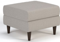
SAMMY OTTOMAN WITH OPTIONAL WOOD LEGS