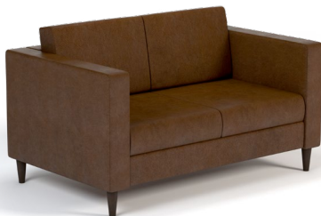
TWO SEAT LOUNGE WITH OPTIONAL WOOD LEGS

Metal Legs: Polished Chrome Wood Legs: Standard Wood Stain