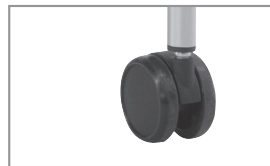
2" CASTERS - CAS2