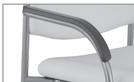
WOOD ARM CAP / 16 FINISHES - WAC