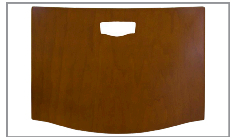
HAND GRIP SQUARE - HG