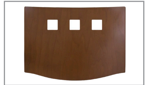
CUTOUTS SQUARE - SQ