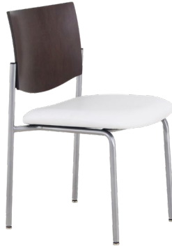
WOOD BACK CHAIR