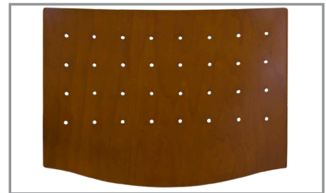
PERFORATED HOLE SQUARE - PH