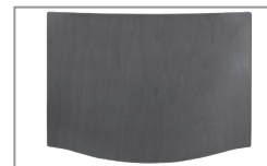
WOOD SQUARE BACK