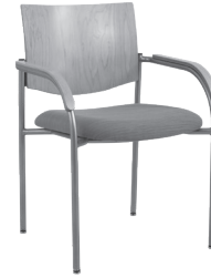
SQUARE WOOD BACK CHAIR WITH ARMS AND WOOD ARM CAPS