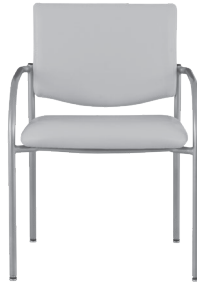
SQUARE BACK CHAIR WITH ARMS

Teriana chairs stack in all 3 widths 19.5", 22" or 26"