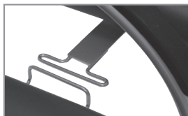
METAL GANGING - GD